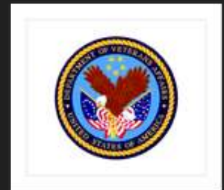
Department of Veterans Affairs