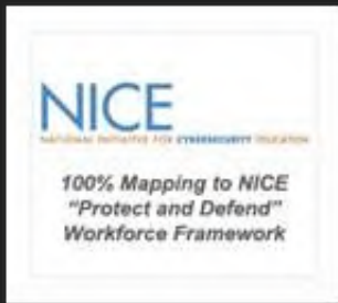
The National Initiative for Cybersecurity Education (NICE)