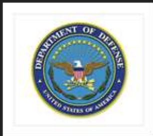
United States Department of Defense (DoD)